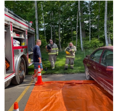
Starting the Jaws of Life demonstration at the Venetian Open House

Many of us can recall the various structure fires that plagued our downtown. It was through the vigilance in the training and responding to those structure fires that our Volunteer Fire Department, along with the help of other departments, was able to keep our city safe.