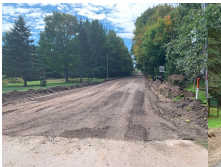
Completion of Mercer Road in Charlevoix Township